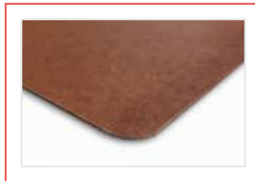
evosure divider board