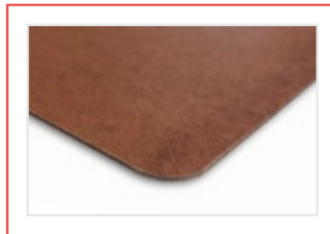
evosure divider board