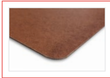
evosure divider board